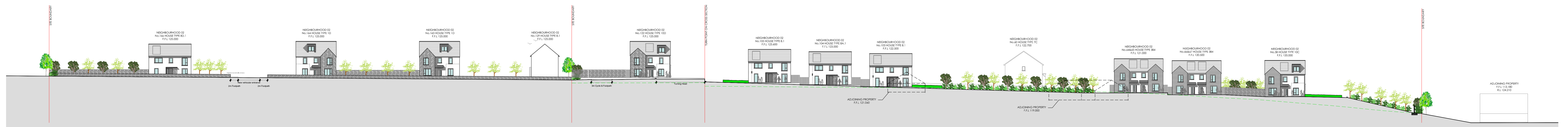
Section 5-5 SCALE 1:400 @ A0