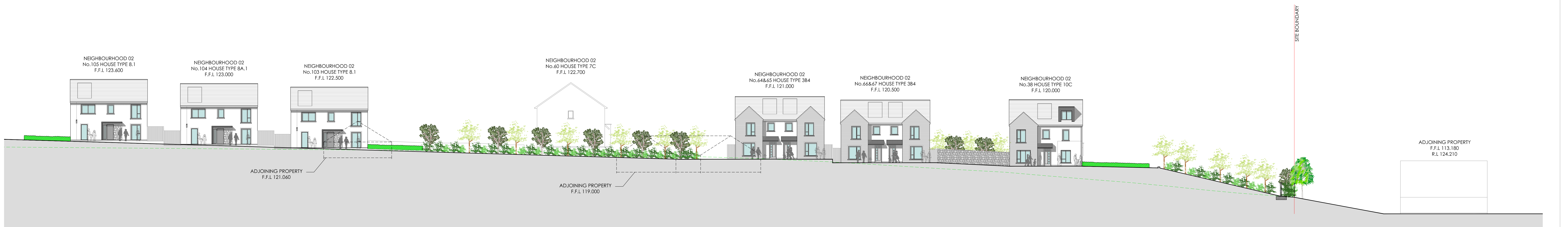
Section 5-5 Part 2 of 2 SCALE 1:200 @ A0